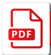
Table and French Canadian Samples will be available in PDF format. All other samples will be available in DOC format. All samples are for informational purposes only and are not intended to be used as a legal document.